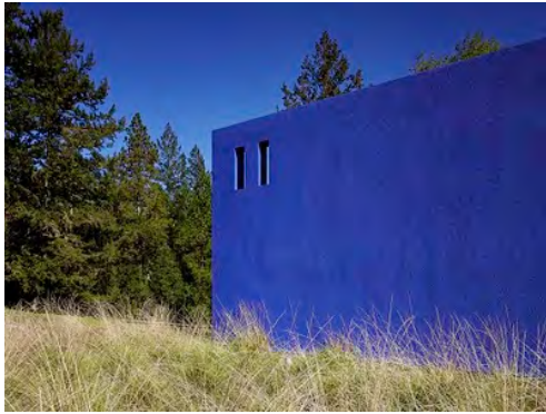
Fernandez placed two large openings high in the 50 feet x 16 feet blue wall, partly to break up the massive scale, but also to offer glimpses of blue sky through the wall. "I also wanted these two 'windows' to be symbolic of the two owners of the house, two souls," said the architect.