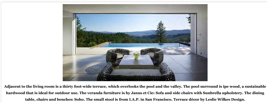
Adjacent to the living room is a thirty foot-wide terrace, which overlooks the pool and the valley. The pool surround is ipe wood, a sustainable hardwood that is ideal for outdoor use. The veranda furniture is by Janus et Cie: Sofa and side chairs with Sunbrella upholstery. The dining table, chairs and benches: Soho. The small stool is from I.A.P. in San Francisco. Terrace décor by Leslie Wilks Design.