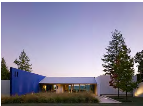
The house was designed to be almost transparent, with natural light and fresh air. An elongated blue stucco wall punctuates the low-slung residence. A concrete path leads to a pivoting glass front door. To the left of the wall is the garage. Construction: Grassi and Associates, Napa.