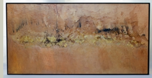
Samarkand 2011-The journey is inside and outside: equilibrium ...

In the City Center Art Lounge 300 Page Street San Francisco